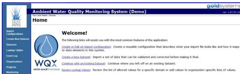
Free AWQMS Demo Available at www.cdsn.awqms.com (click AWQMS Applications>AWQMS Test

We are grateful to the EPA and WQCD for supporting this aspect of DSN.